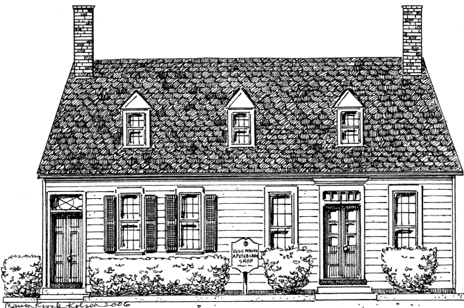
Hugh Mercer Apothecary Shop